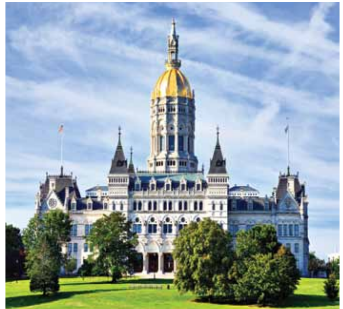
Connecticut State Capitol in Hartford, Connecticut.