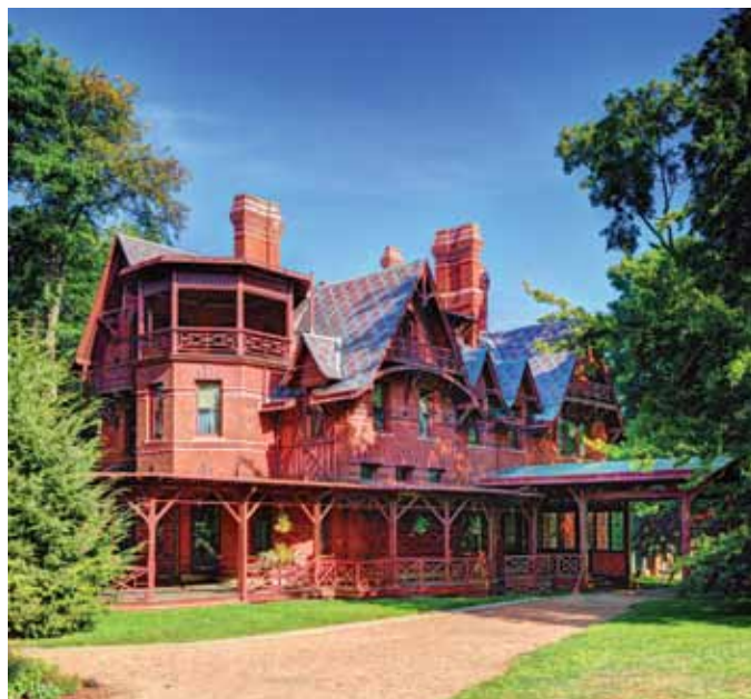
Mark Twain House in Hartford, Connecticut.