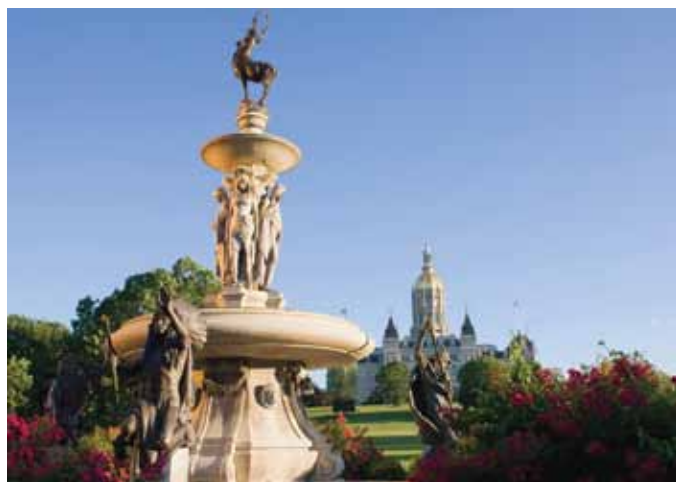
Corning fountain in Bushnell Park with Capitol building in background.