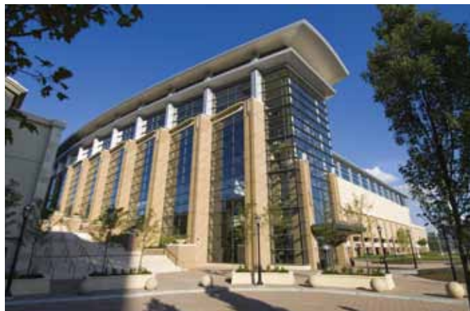
Connecticut Convention Center, NESO 2014 Annual Session meeting site.

including; Major Public Utility Companies, Intel Corp. and Delta Airlines as well as numerous dental and orthodontic companies including Align Technology and Ormco. He is the principal member of VisionTrust Communications, providing staff training, customized communications tools and consulting with a primary emphasis on practice development, including many of the top dental practices in the world.