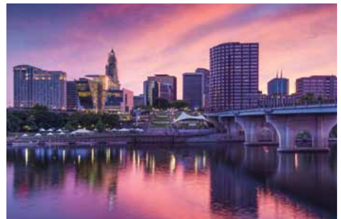
The skyline of downtown Hartford, Connecticut at dusk from across the Connecticut River.