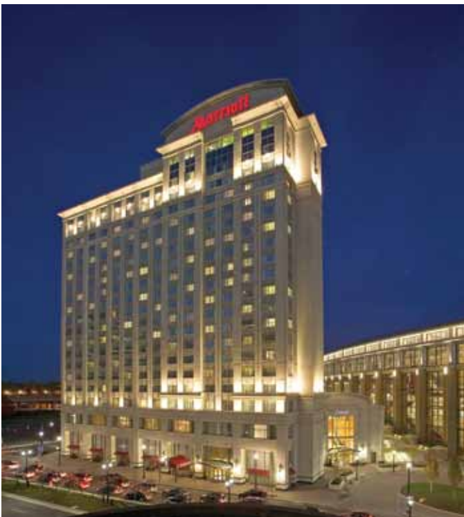
Marriott Hartford Downtown, NESO 2014 Annual Session meeting site.

Located in the Adriaen's Landing District of Hartford, the Marriott Hartford Downtown overlooks the Connecticut River and is interconnected with the Connecticut Convention Center. Attracting business and leisure travelers alike since 2005, this 409 room upscale hotel is AAA rated with four Diamonds. Local Hartford attractions within walking distance include Spotlight Theater, Wadsworth Atheneum, The Bushnell for Performing Arts, Old State House, XL Center and the State Capital Building. The Connecticut Science Center, an interactive educational science museum for adults and children, is adjacent to the hotel. Other area highlights include the Comcast Theatre, Travelers, Aetna, Pratt & Whitney, and UTC. This Marriott hotel combines the beauty of a grand hotel with contemporary amenities including a spa, fitness center, upscale dining and high-speed Internet access.