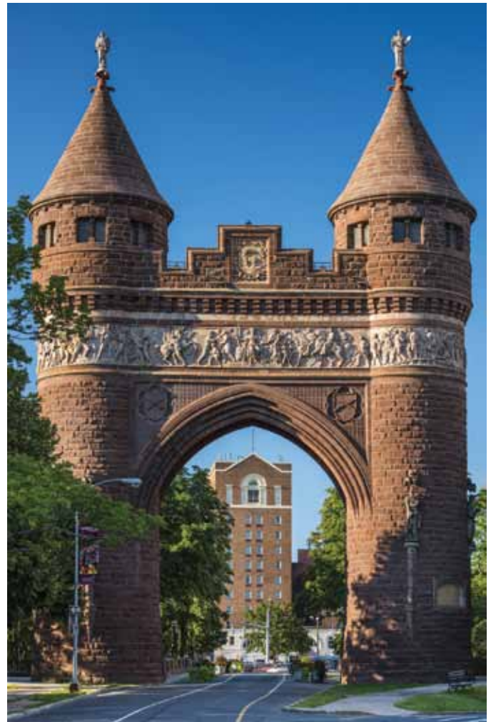
Soldiers and Sailors Memorial Arch, Bushnell Park, Hartford, Connecticut.

NESO designates this activity for a maximum of 15.5 credit hours of continuing education credits for doctors and staff.